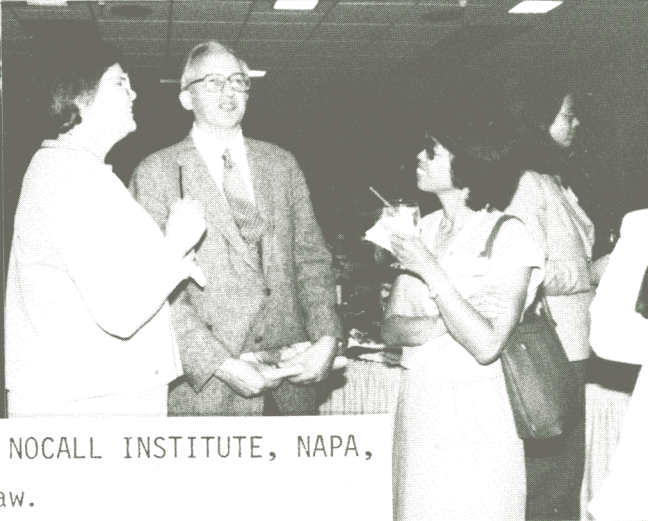
NOCALL MEMBERS ENJOYING THE FIRST ANNUAL NOCALL INSTITUTE, NAPA, MAY 15-16, 1981.