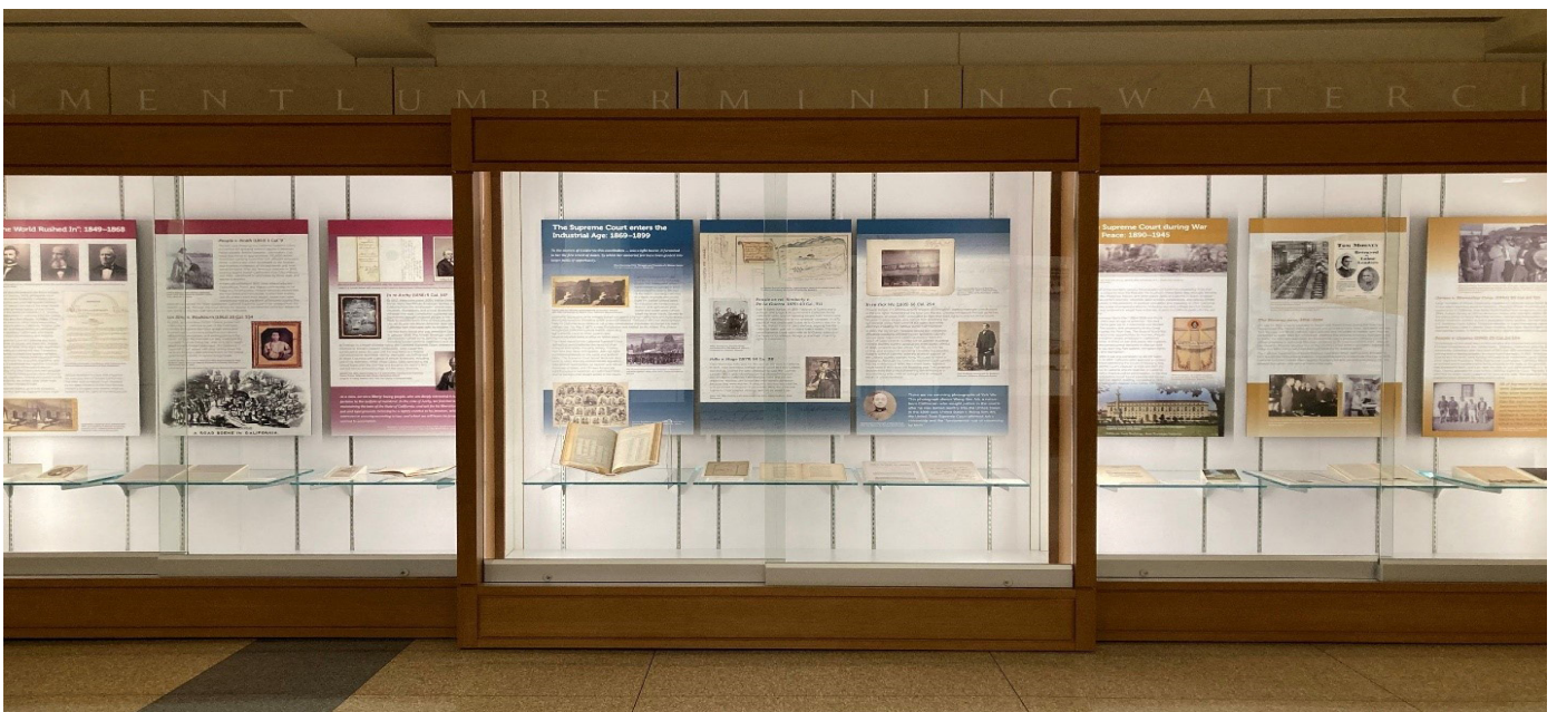
A segment of the new exhibition, Expanding Justice for All: The Supreme Court of California in Times of Change

The exhibition also features materials related to the California Supreme Court’s unwillingness to protect enslaved people in the “free” state during the antebellum period. One such case was In re Archy (1858) 9 Cal. 147. Archy Lee, an 18-year-old